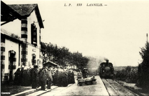
L. P. 133 LANNILIS. —